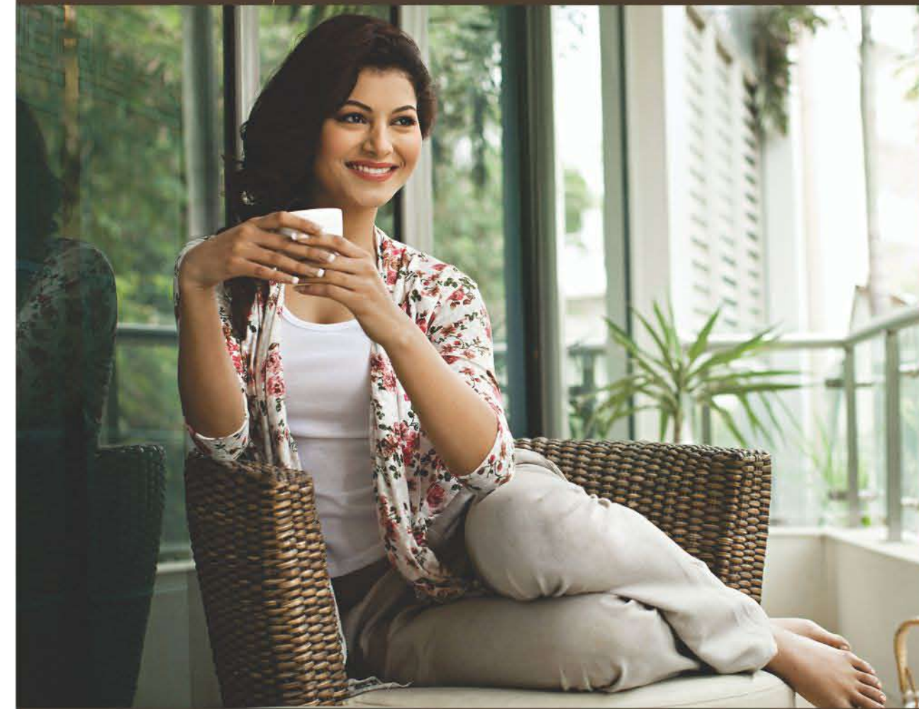
SIT-OUTS & VIEWING BALCONIES.

More Delightful Features, More reasons to say YES !