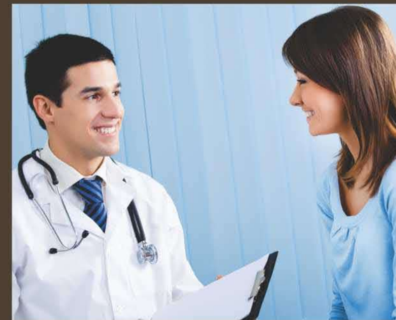
DOCTOR ON CALL